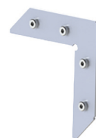
LOCK-SYSTEM Angled L

SLEEK SINGLE-SIDED FRAME SILICON EDGE GRAPHIC (SEG)