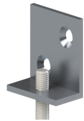
ACCESSORIES Mounting Bracket