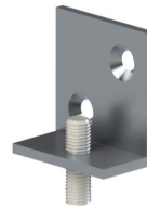
ACCESORIES Mounting Bracket