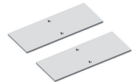
ACCESORIES Freestanding Base